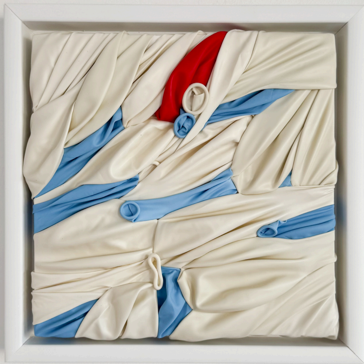
When I think about you - 1 Balloons, Wood, 20 x 20 cm, 2025