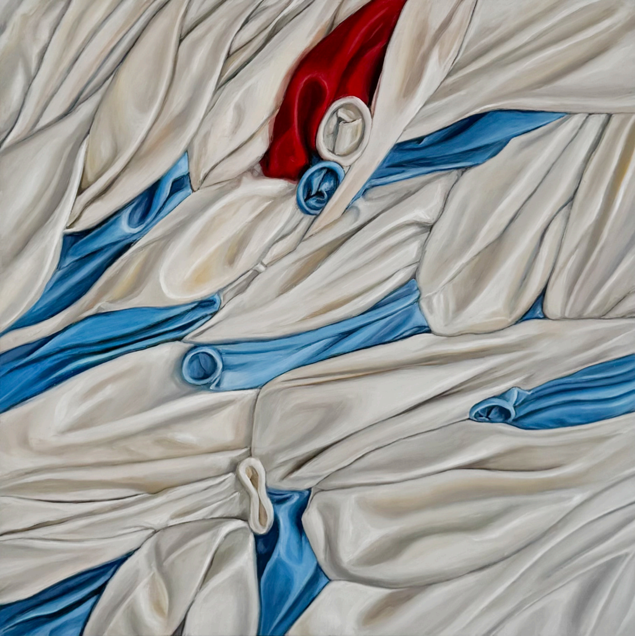
When I think about you – 2 Oil on Wood, 20 x 20 cm, 2025